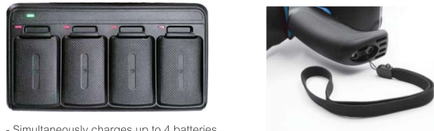
- Simultaneously charges up to 4 batteries